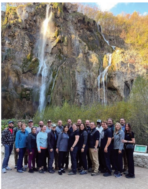
Class 51 in front of a waterfall at Plitvice Lakes National Park, Croatia