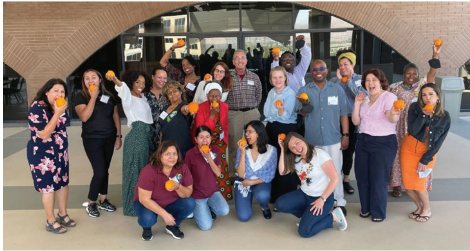
The Invest Health Delegation from Tallahassee, St. Paul, Buffalo, and Grand Rapids enjoyed Riverside’s hospitality in June, 2022.