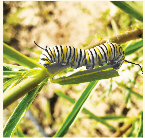
A Western Monarch caterpillar eating a native narrowleaf milkweed, Asclepias fascicularis .

Surveys involve stooping, bending and kneeling on the ground. Ability to use a smart phone with the iNaturalist app is helpful but not required.