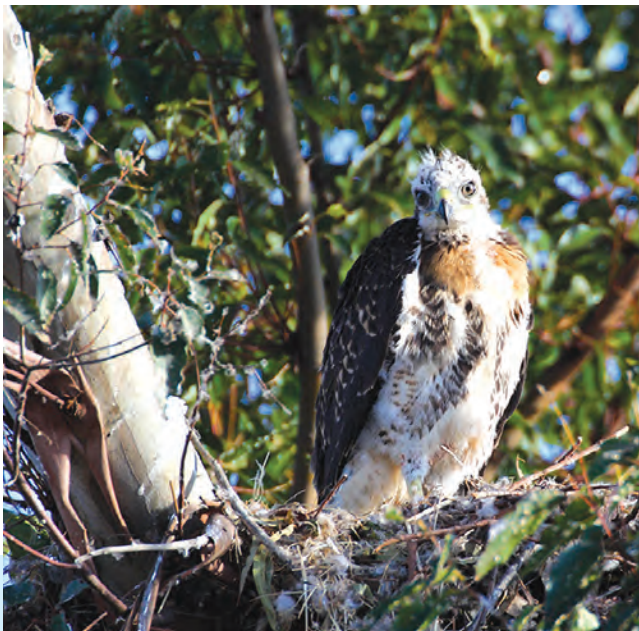
Juvenile red-tailed hawk in the nest.