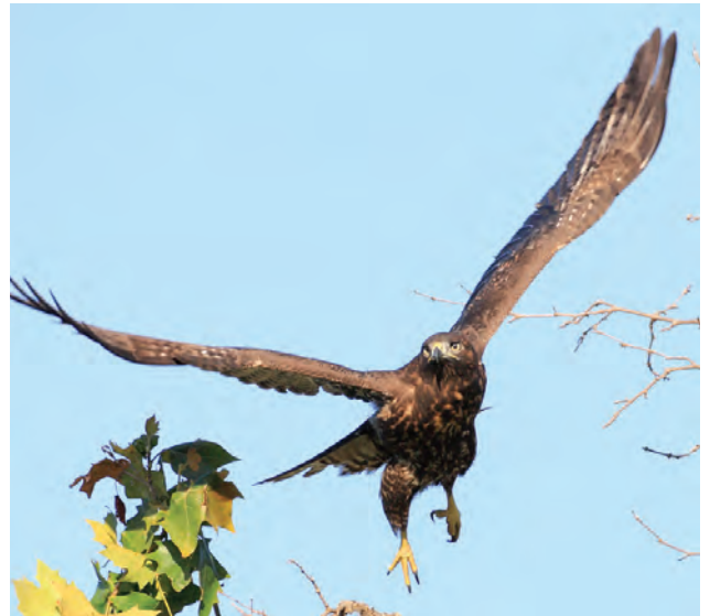
Dark-morph red-tailed hawk launching into flight.

Red-tailed hawks are not listed as a threatened or endangered species and have a stable population. However, they still face threats which are mainly linked to humans. We humans like to build on open, flat land which the hawks prefer for hunting. Hawks also face threats from automobile and power line collisions, shootings, and poisoning from eating poisoned rodents.