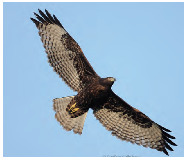
Dark-morph red-tailed hawk soaring over its territory. Most red-tailed hawks are rich brown above and pale below, with a streaked belly and, on the wing underside, a dark bar between shoulder and wrist. "Dark-morph" birds are all chocolate brown with a warm red tail.

Come by the Sycamore Creek Interpretive Center (SCIC) and you may see the red-tailed hawk pair that call our property home. They were observed courting, and we hope they will nest nearby. They can be seen soaring over the center, calling, or perched on the tops of our sycamores. For information about SCIC, contact us at (951) 277-0219, at RCRCD's main office: (951) 683-7691, Ext 223, or see http://www.rcrcd.org/#Sycamore_Creek_Interpretive_Center