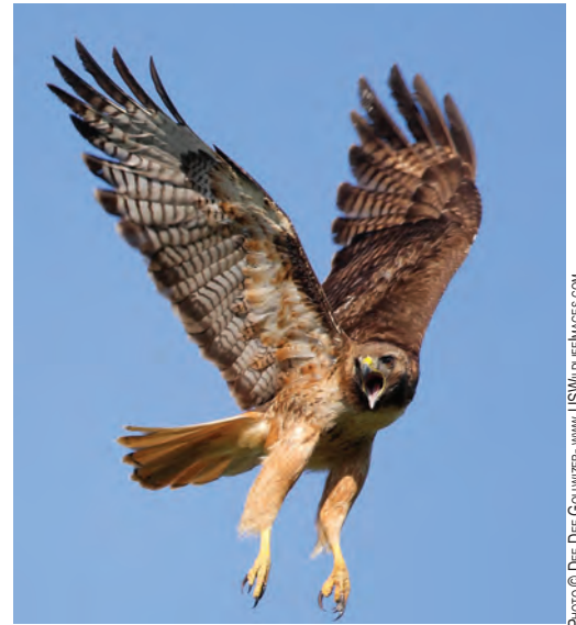
Female red-tailed hawk calling while in flight.

In late winter or early spring, you may be lucky enough to spot a red-tail pair performing their courtship display. Red-tailed hawks are monogamous and can mate for life. Their display involves an impressive ceremony of aerial acrobatics and plunging dives to Earth. If love is in the air, the pair may lock talons and descend in a beautifully choreographed tumble towards Earth, letting go of each other at the last moment. The pair will construct or repair an old nest with large sticks and greenery. The female may lay 1-5 white, splotchy-brown eggs. Once the chicks arrive, both parents participate in rearing. The chicks are fully grown and fledge the nest after approximately 50 days.